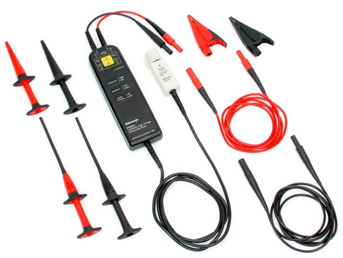
The P52xxA Series probes provide high-voltage differential measurement solutions for any oscilloscope.