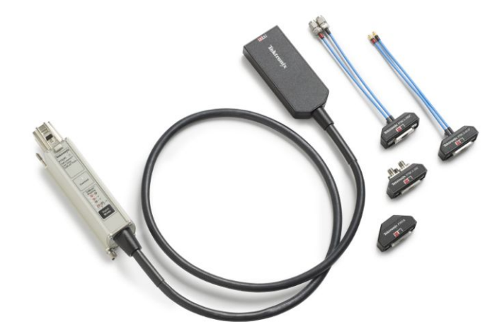
P7633 Low Noise TriMode Probe

The P7600 Series TriMode probes and the MSO/DPO70000DX and DPO/ DSA70000D Series Oscilloscopes are designed to deliver the industry's lowest system noise levels. This high sensitivity is critical for being able to make accurate measurements on low amplitude signals.