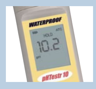
pHTestr 10 has 0.1 pH resolution for general use