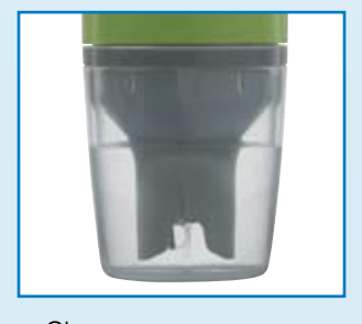
Clear cover serves as a solution holder for easier calibration and measurement.

Great for basic applications like drinking water, hydroponics, aquariums, education, and routine labwork.