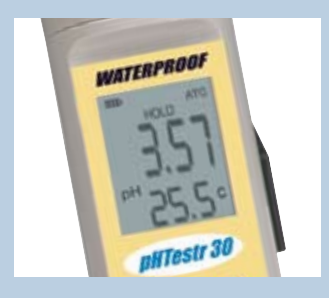
pHTestr 30 has 0.01 pH resolution plus simultaneous display of temperature— no need to purchase or carry a separate thermometer.