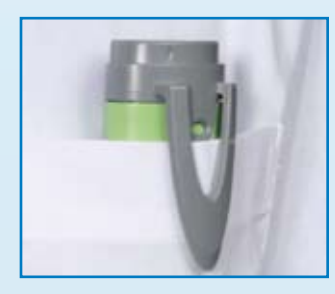
Built-in belt clip allows you to keep meter accessible when not in use.