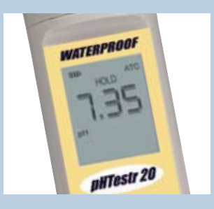
pHTestr 20 has 0.01 pH resolution for greater precision