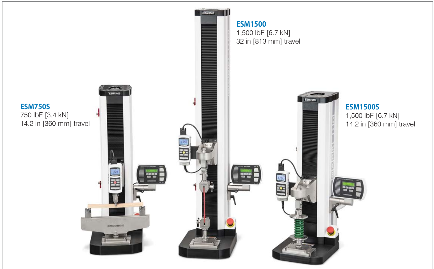
ESM750S 750 lbF [3.4 kN] 14.2 in [360 mm] travel