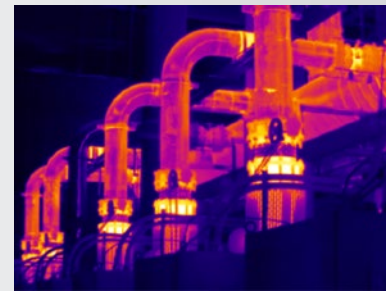
MultiSharp Focus, available on the Ti450 PRO