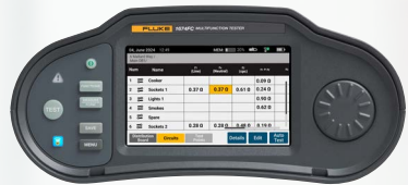
Multifunction Installation Tester