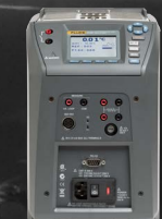
Field Metrology Well