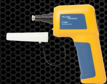
FiberInspector™ Ultra Camera