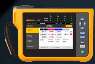
Power Quality Analyzer