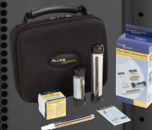
Fiber Optic Cleaning Kits