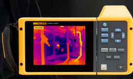
Articulating Thermal Camera