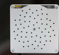
Fixed and Mount-and-Move Acoustic Imager