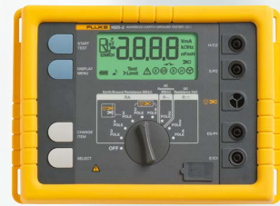
Earth Ground Tester