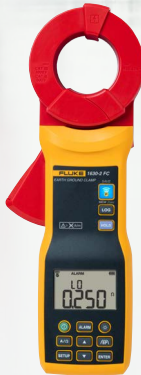
Earth Ground Clamp Meter