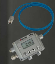
Infrared Spot Pyrometer