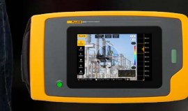
Handheld Acoustic Imager