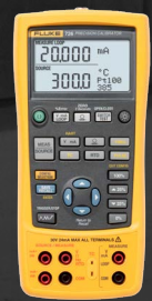
Multifunction Process Calibrator