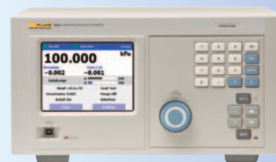
Fluke controller/calibrator models recommended for calibrating 700P pressure modules are 7250i or 7250xi for modules with ranges up to 20 MPa (3,000 psi), and PPC4 with standard Q-RPTs for modules with ranges up to 14 MPa (2,000 psi). To achieve the lowest uncertainty, 7250xi should be used. For low inches of water range modules, 7250LP is offered.