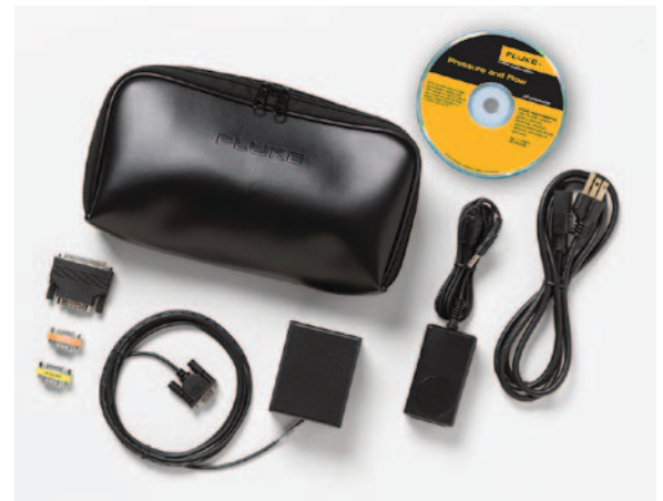
PK-700-CAL 700 Series Pressure Module Calibration Kit

COMPASS for Pressure version 4 includes the functionality to remotely adjust the first of what will likely be numerous digital handheld pressure calibrators. With COMPASS for Pressure loaded on a PC, an automated pressure calibrator and the Fluke Calibration PK-700-CAL calibration kit (including both hardware and software), any calibration laboratory can now run a fully automated, unattended calibration on one or more 700P modules.