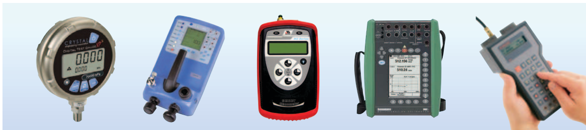
COMPASS can potentially be used to perform automated adjustments of other interfaceable calibrators and measurement devices.