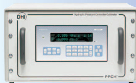
For higher pressure module calibrations up to the 10,000 psi maximum, the 7615 and PPCH models are the controllers to choose.