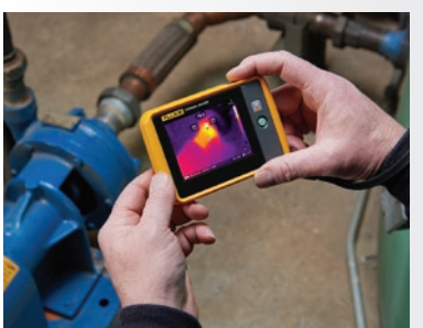
Small enough to carry every day without worry. Pocket sized. Stands up to dirt and water. Quick scans of electrical equipment, machinery and other assets.