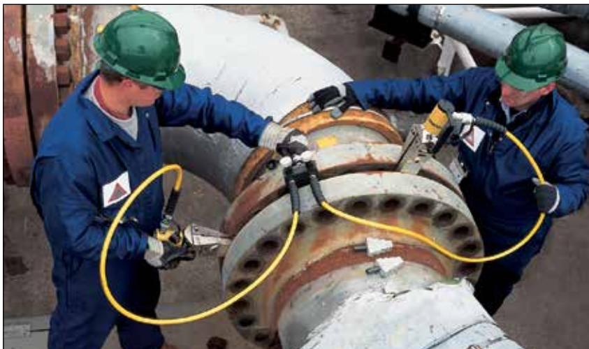
◀ Two FSH14 spreaders used simultaneously with Enerpac handpump, hoses and AM21 control manifold.