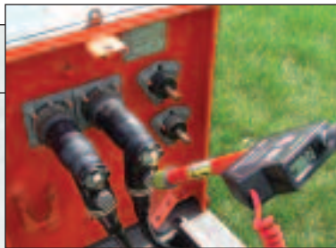
DVM-80T Taking Elbow Test Point Measurement