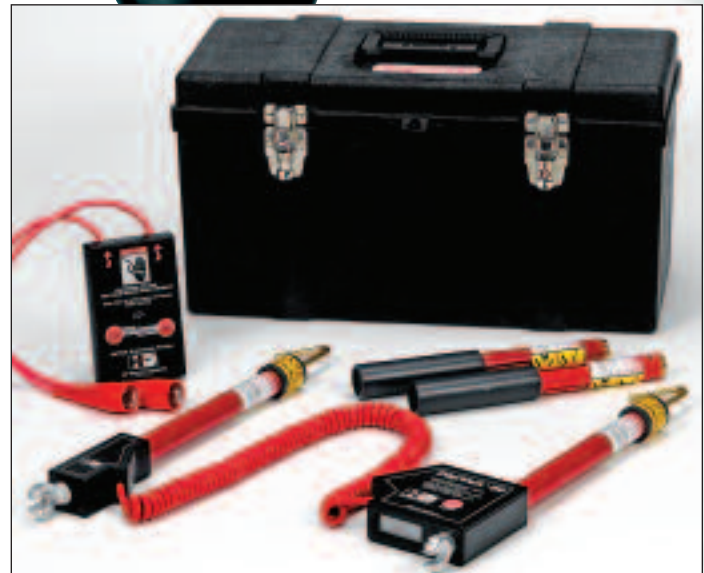
DVM-80 Kit with PT-5000B Proof Tester® and pair of R-80 add-on resistors