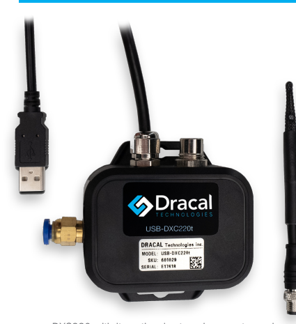
DXC220 with its optional external connector and temperature probe.