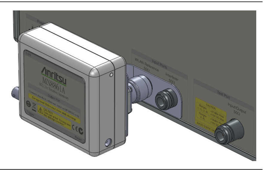
Figure -2. MN8861A Mounted on the MT8860C

4. Slide the two holes in the stabilizing bracket over the "WLAN Reference" and "Interferer" input ports on the MT8860C as shown in the figure below.