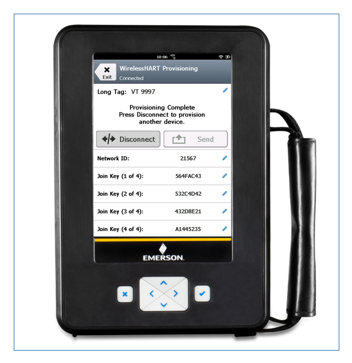
Easily provision multiple devices in a fraction of the time.