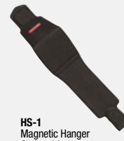
HS-1 Magnetic Hanger Optional Accessory