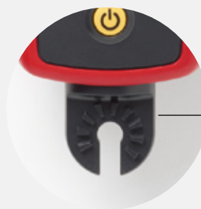
AT-8000-R universal attachment bracket for AT-410 Hot Stick attachment.