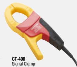
CT-400 Signal Clamp Optional Accessory