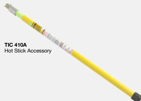
TIC 410A Hot Stick Accessory