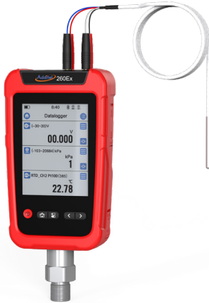
ADT260Ex with AM1602 temperature probe

Note: The ADT260Ex can be purchased without the ADT158Ex module If needed using the following part number: ADT260EX-NO