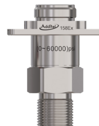
"ADT158Ex pressure module - for use with ADT260Ex (bottom mount)"