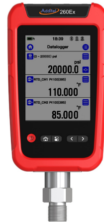
Additel 260EX with ADT158Ex module