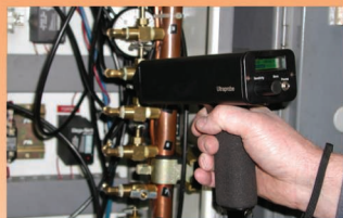
Detect air leaks