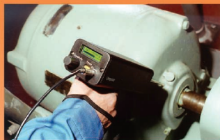
Test bearing condition