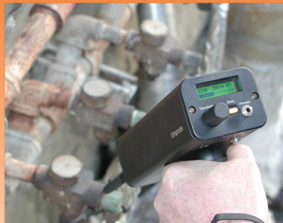
Inspect steam traps