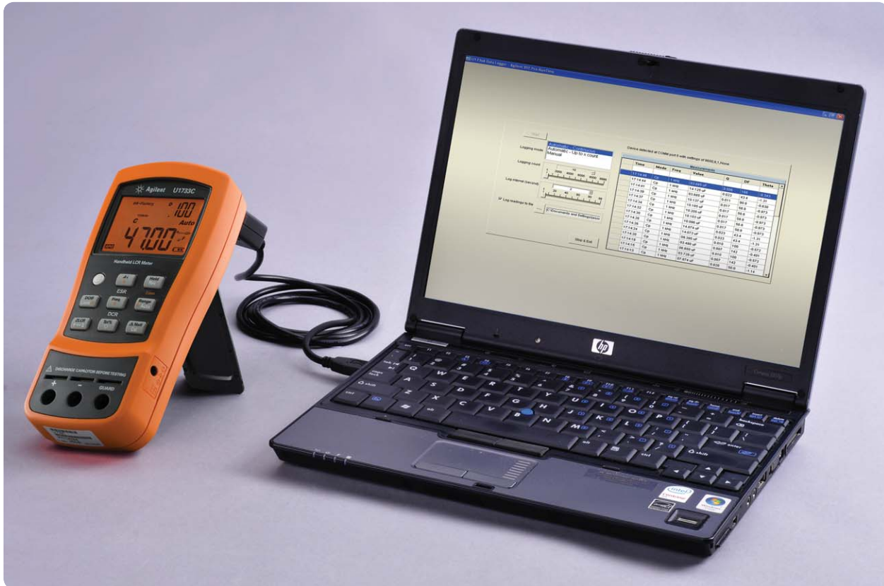
Figure 1. Automate the recording of continuous readings when you hook the U1731C/U1732C/U1733C to a PC

The handheld LCR meters allows you to test various component types, including secondary components of Dissipation Factor (D), Quality Factor (Q), and Angle Indication of Impedance ( \theta ). This new handheld series also includes other functions that result in a more detailed component analysis. For example, the built-in Equivalent Series Resistance (ESR) function helps you better understand the inherent resistance behavior typically found in capacitors across selected frequencies. DCR is a built-in DC resistance measurement that eliminates the use of a separate digital multimeter (DMM) for component test.