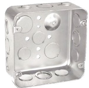
2-Gang Junction Box (Hardwired AC or DC)

The SBS-H2 Hydrogen Detector is a complete hydrogen monitoring system with visual and audible alarms.