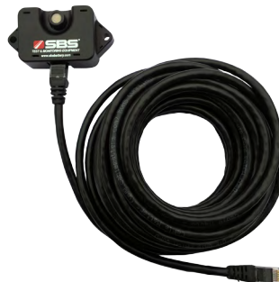
Additional Hydrogen Sensor/25 ft. Cable (Optional 50 ft. and 100 ft. Cables)