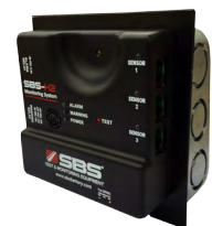
2-Gang Junction Box (Hardwired AC or DC - optional)