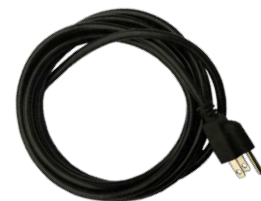
18 AWG AC Cord (optional)