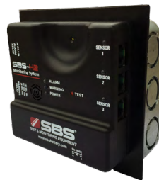
2-Gang Junction Box Hardwired AC and/or DC (optional)