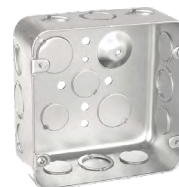
2-Gang Junction Box (Hardwired AC and/or DC)