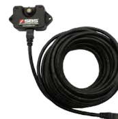
Additional Hydrogen Sensor with 25 ft., 50 ft. or 100 ft. Cable