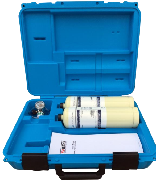
SBS Test Kit – Part# H2-TESTKIT

The sensor and display have been calibrated at the factory for hydrogen gas and should not need adjustment at the time of installation.