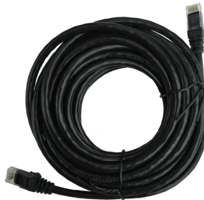
25 Ft. Cable Extension