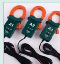
Model PQ34-12 1200A Current Clamp Probes with 2" (50mm) jaw opening