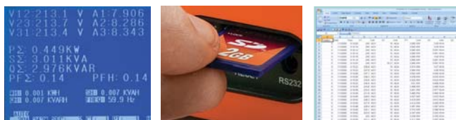
Backlit LCD displays numerical values. The data can be stored in SD memory card (included) and then transferred from meter to PC using Excel ® software and datalogged readings.

Complete with meter, 4 voltage leads with alligator clips, 8 AA batteries, SD memory card, Universal AC adaptor (100 to 240V), and durable hard carrying case. Clamp probes sold separately.