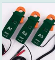
Model PQ34-2 200A Current Clamp Probes with 0.8" (19mm) jaw opening

Choose the best clamp probes to fit your application needs ranging from 200A to 3000A and flexible vs traditional jaw type.