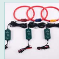
Model PQ34-30 3000A (24"/600mm) Flexible Current Clamp Probes for wrapping around busbars