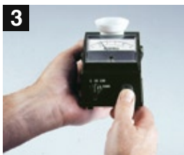
3 Push button to indicate reading