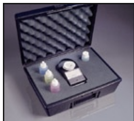
Porta-Kit with EP11/PH

All Myron L instruments are factory calibrated with Standard Solutions of known conductivity/TDS values and (when appropriate) with pH buffer values 4, 7 and 10. These solutions and buffers are traceable to the U.S. Government's National Institute of Standards and Technology.