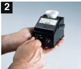
2 Select Conductivity/TDS range