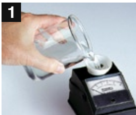
1 Rinse and fill cell cup