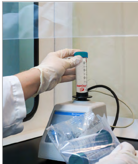
SuperClear® flat caps are leak-resistant and keep your sample secure while using a vortexer or rocker.

PLUG CAPS: offers a secure seal for extended storage. Plug caps do not include elastomeric sealing ring, but still feature a very deep sealing area.