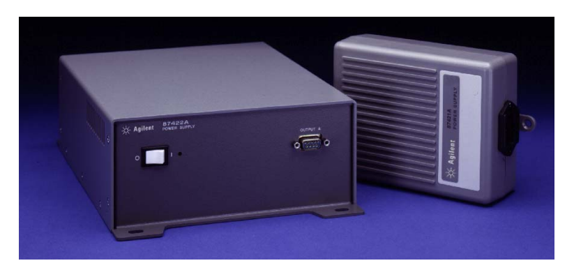
Figure 1 87421A and 87422A Power Supply

The 87421A and 87422A power supplies are universal input, dc switching power supplies designed to provide the bias voltages needed to operate microwave system amplifiers.