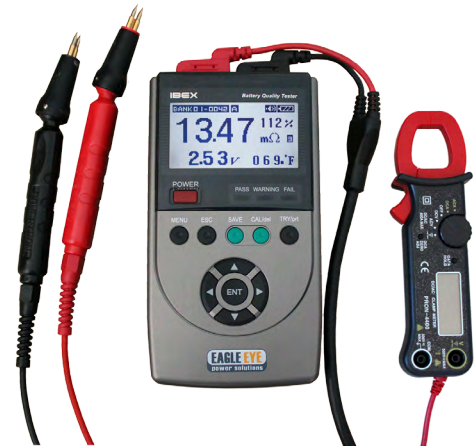
IBEX-Ultra with 4-Pin Test Leads and CT Clamp Meter

The IBEX-Series is commonly used in the utility, telecommunications, UPS, transportation, and mission critical industries, and is the preferred battery tester by service groups worldwide. The IBEX injects a minimal test current into the tested batteries and precise & repeatable results appear in just 3 seconds. Battery Management Software is included with each IBEX-Series kit to easily identify bad cells, create reports, save data, and ensure the integrity of backup power systems.