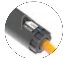
Connection lock mechanism