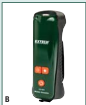
A. Articulating (6mm diameter) camera tip adjusts up to 320° viewing angle with four built-in bright LED lights illuminate dark areas B. HDV-WTX — Optional Wireless Transmitter transmits video to the main display from tight or hard to reach places up to 100ft (30m) away