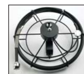
Camera probes with cable length greater than 3m will be coiled on a spool as shown on the left.