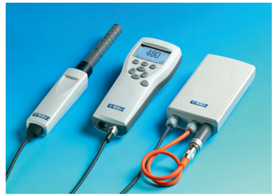
The Vaisala CARBOCAP<sup>*</sup> Hand-Held Carbon Dioxide Meter GM70 is the demanding professional's choice for hand-held carbon dioxide measurement. The meter consists of the indicator (center) and probe, used either with the handle (left) or pump (right).

The Vaisala CARBOCAP<sup>*</sup> Hand-Held Carbon Dioxide Meter GM70 is a user-friendly meter for demanding spot measurements in laboratories, greenhouses and mushroom farms. The meter can also be used in HVAC and industrial applications, and as a tool for checking fixed CO_2 instruments.