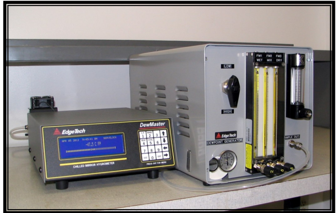
DewGen with DewMaster/S3

Input Gas Requirement: Dry gas less than 115 ppm (-40C dew point), 13 SCFH (6 liters/min), 30 to 100 psig