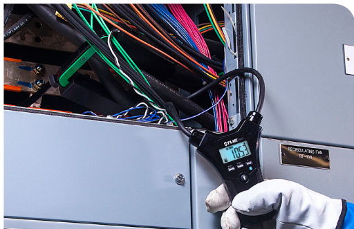
FLIR CM57's Flexible Cable works into tight areas