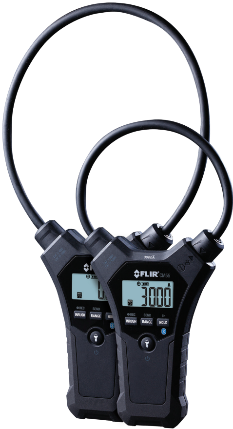
CM57 & CM55 Flexible Clamp Meters