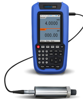
Additel 223A with ADT160A Pressure Module