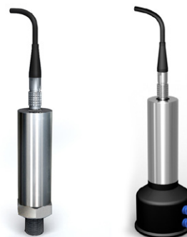
Gauge pressure Differential pressure