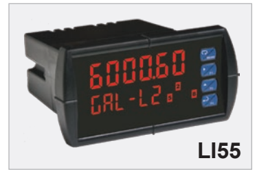
Commander™ Multi-Tank Level Controller