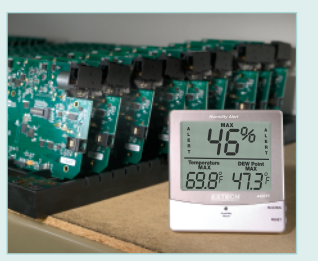
Indicates Humidity and Temperature levels in Production areas.