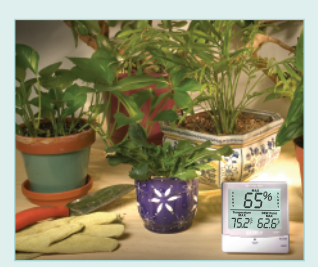
Checks the Humidity and Temperature levels for optimal plant growth in greenhouses.