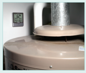
Monitoring Dew Point levels in a Basement for potential mold growth.