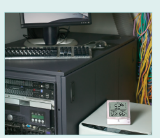
Alerts low Humidity levels in Computer rooms to help prevent electrostatic conditions.