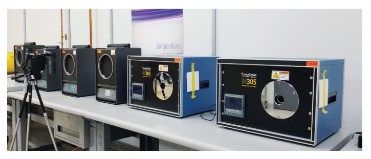
Figure 2: Calibration of a Thermal Imager Using Blackbody Sources

The calibration of these instruments is still very important because, even for relative measurements, you need to ensure the difference in temperature is within a degree of accuracy that is reliable. But there is more to the calibration on these instruments than there is for a thermometer. With an IR thermometer, there is a single focal point that senses the temperature of the skin. During calibration, a thermometer is checked at multiple temperature values across its designed measuring range to ensure it is maintaining its accuracy no matter what temperature you are reading. The same holds true for a thermal imager or line scanner with regard to checking multiple temperature values across the measuring range (see fig. 2). But, with these devices pixel calibration across the image is just as important. Again, a thermometer has a single focal point for temperature measurement while a thermal imager (which is a camera that uses the infrared spectrum) measures multiple points at once across the image.