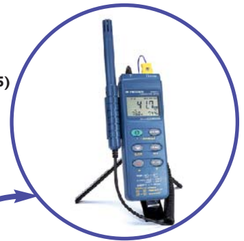
Tripod Mountable (tripod not included)