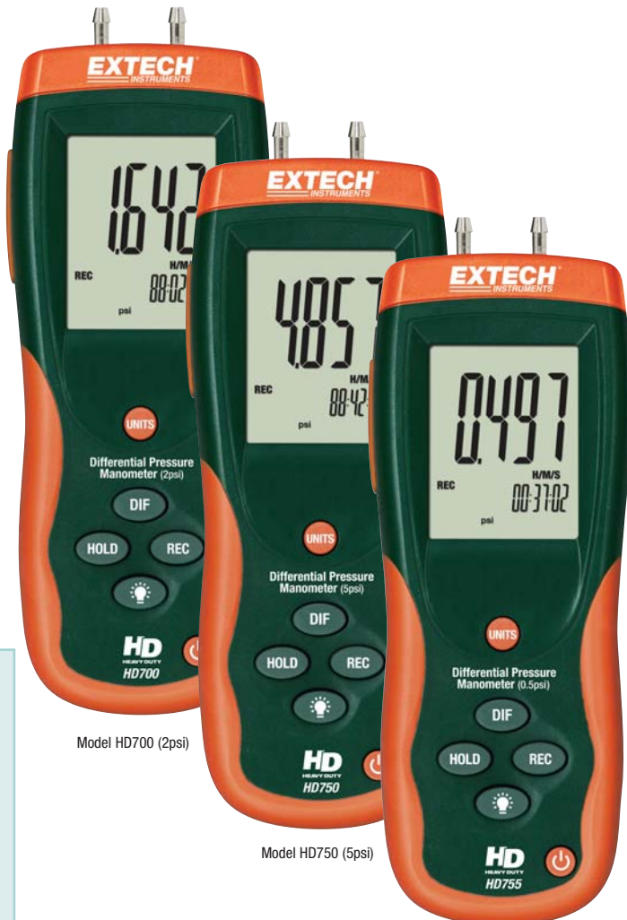
Model HD700 (2psi)