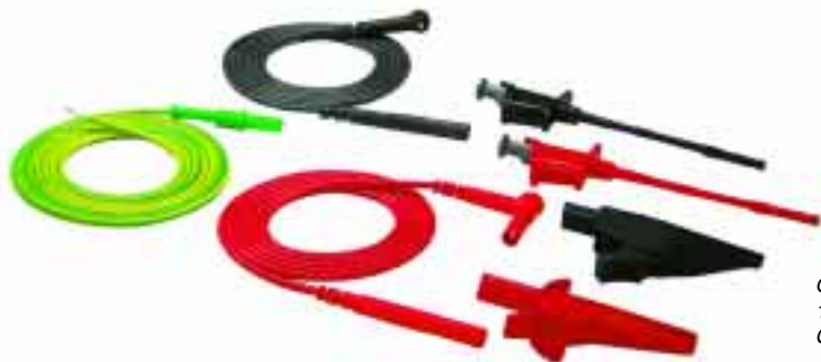
Optional Lead Set includes: 2 color coded leads, 1 ground lead (stripped), 2 alligator clips, and 2 grip probes Catalog #2117.78