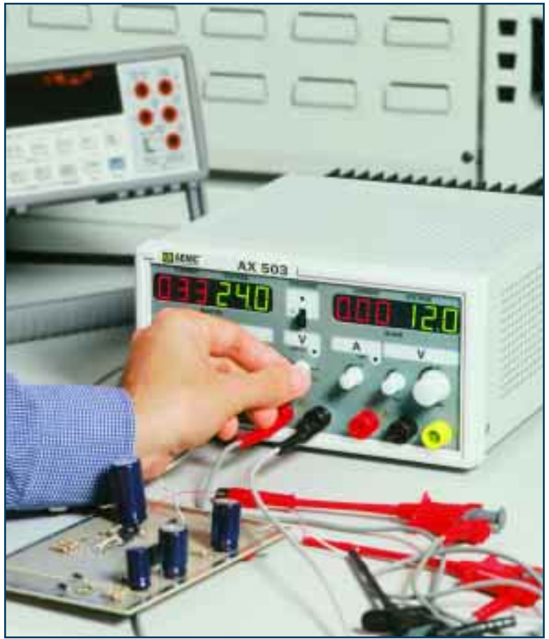
Voltage levels and current limits are easily adjustable from the front panel.

Three models are available offering single, dual and triple output capabilities. The single output, Model AX501 offers a 0 to 30VDC supply while the Models AX502 and AX503 each offer dual 30V outputs. Each provides the ability to display both voltage and current for each output. Additionally, the Model AX503 offers a 5V blind output which is adjustable from 2.7 to 5.5V. Dual 30V outputs can be connected in series to provide double the output voltage up to 60V, or they can be connected in parallel providing double the current output up to 5A. The Models AX502 and AX503 offer a unique master/slave tracking arrangement whereby the ratio between master and slave can be set-up on the fly as needed during the test. Adjusting the master voltage causes the slave to track. Adjusting the slave voltage causes the ratio from master to slave to change accordingly. All three models offer both a Coarse and Fine voltage adjustment as well as current limiting adjustment. Each of these supplies are built to provide many years of reliable, precise, easy-to-use operation and will be a welcome addition to any lab, test bench or production line.