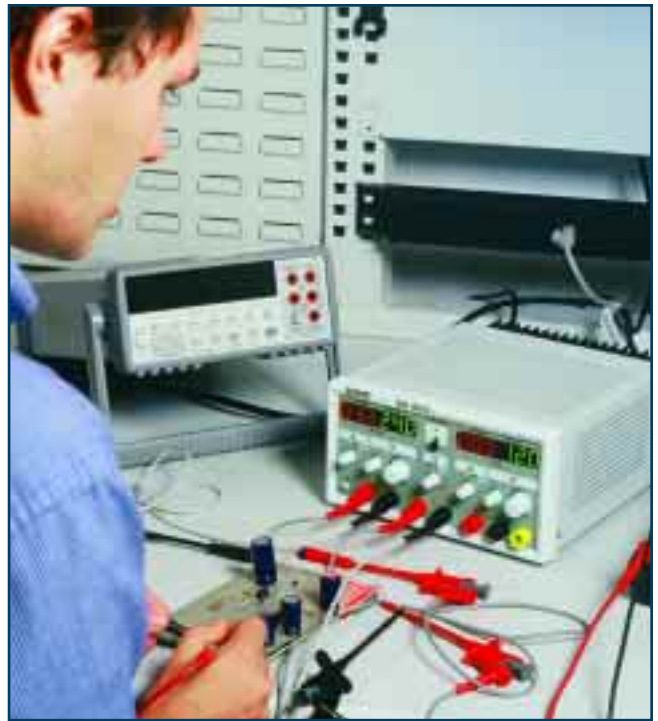
Circuit board design testing using the 30V and 5Vdc outputs