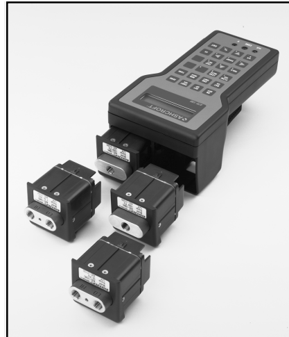
Model ATE-100 with AQS "Quick Select" Modules

SM-1 Voltage Adapter – allows ATE-100 to be used to check "live" pressure switches