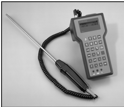
Model ATE-100 with AQS-RT1 and RTD Probe installed

Programmed to provide direct temperature readout from types J, K, T, E, R, S, B & N thermocouples or direct millivolt readout from any thermocouple.