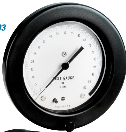
4-1/2" Model 1403

Series 1400 4-1/2" SOLFRUNT test gauges are designed to combine laboratory test gauge accuracy with carrying case or rolling test stand portability, and frequently are permanently installed on instrument shop test benches or test panels. These gauges feature a \pm 0.25\% accuracy (Grade 3A) solid front case, which provides a partition between the pressure measuring element and the window, with a pressure relieving back. Accurate gauge reading is accomplished by sighting the knife edge of the indicating pointer with the paralleling pressure graduation, while simultaneously eliminating the pointer's image on the mirrored dial edge. An adjustable pointer provides front zero adjustment. Other calibration adjustments can be made from the back without removal from the case. Metric ranges are available upon request.