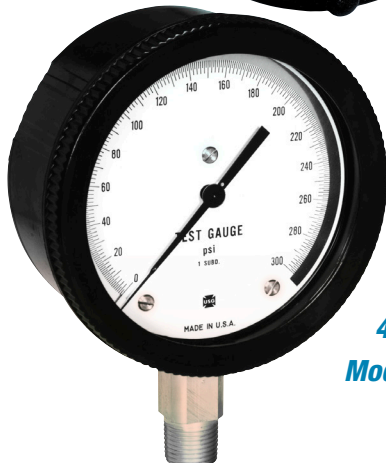
4-1/2" Model 1404