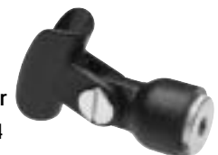
Tripod Mount Microphone Holder Model No. 00184