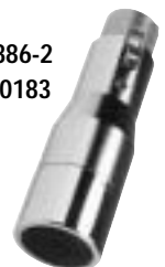
Extra Microphone For 886-2 Model No. 00183

Sound pressure level calibrators are used before or after taking measurements with sound level meters and noise dosimeters. The 890-2 can adjust Simpson models 886-2 and 884-2 or other sound level meters with a 1" diameter Microphone. The 890-2 provides a constant 94 dB or 114 dB sound pressure level at 1 KHz (0 dB = 0.0002 Mbar). Calibrator is immune to a wide range of temperature and humidity conditions while maintaining tight output level tolerances.