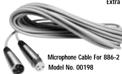
Microphone Cable For 886-2 Model No. 00198