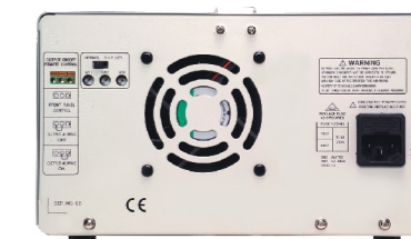
GPS-001 Voltage/Current protection Knob