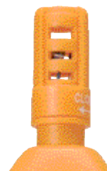
Unique sensor cap design Twist to open or close sensor for storage.