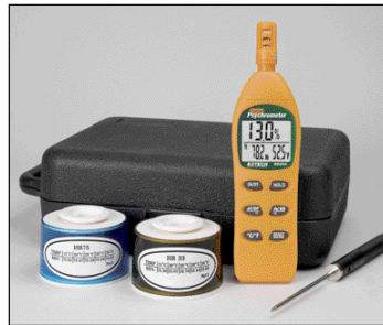
RH305 Digital Psychrometer Kit includes RH300, 33% and 75% calibration bottles, temperature probe, and carrying case.