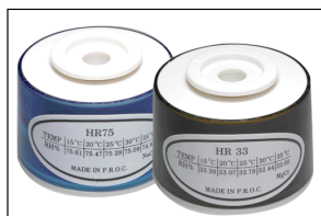
RH300-CAL Optional calibration salt bottles