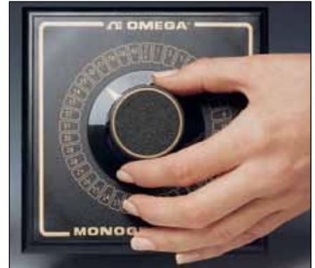
MONOGRAM® SERIES with gold plated contacts

Two pole SW and OSW series switches have a convenient "off" position. The "off" position may be left as an open circuit or shorted to keep spurious signals from registering on thermocouple instruments. Each pole is fully isolated. For quick and easy wiring, the terminals located at the rear of the switch are clearly marked.