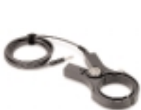
Inductive Signal Clamp