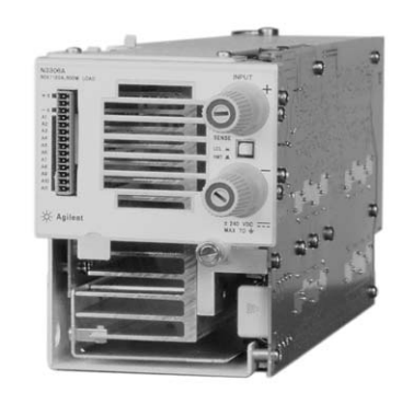
Standard DC connectors

Applications which require repeated connections/disconnections are better suited to the standard connector. The standard connector accepts an unterminated wire, and may be hand-tightened. This connector is specifically designed for bench applications and short-term automated tests.