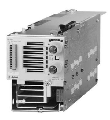
Option UJ1 8 mm screw connectors

Design a system to test a variety of products: This series consists of 2 mainframes and 6 modules. The N3300A mainframe is full rack width. It has 6 slots. The N3301A mainframe is half rack width. It has 2 slots. Any assortment of the 6 different modules can be configured into these mainframes, up to the slot capacity. The N3302A (150 watts), N3303A (250 watts), N3307A (250 Watts) and N3304A (300 watts) each require one slot. The N3305A (500 watts) and the N3306A (600 watts) each require 2 slots. The electronic load can be configured to supply exactly what you need now, and this modular design also allows for easy future reconfiguration.