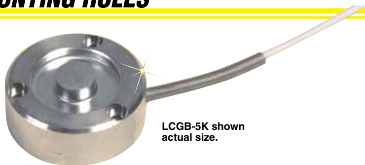
LCGB-5K shown actual size.

The LCGB Series comprises miniature low-profile compression load cells with excellent long-term stability. An all stainless steel construction ensures reliability in harsh industrial environments. These cells are designed to be mounted on a flat surface using cap screws to secure them to the base. A load button is integral to their basic construction for even force distribution.