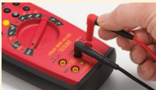
Universal plugs compatible with all 4 mm shrouded inputs