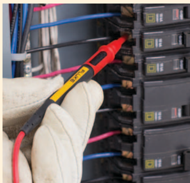
Reduce tip exposure for CAT III testing