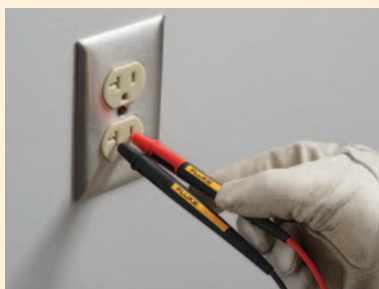
Increase tip exposure for CAT II probing