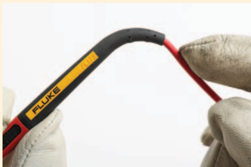
Extreme strain relief tested to withstand over 30,000 bends