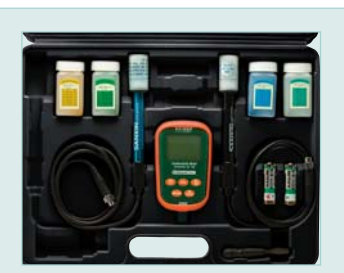
Read to use complete kit includes all the necessary accessories stored in a hard carrying case for easy transportation. Ideal for field use.