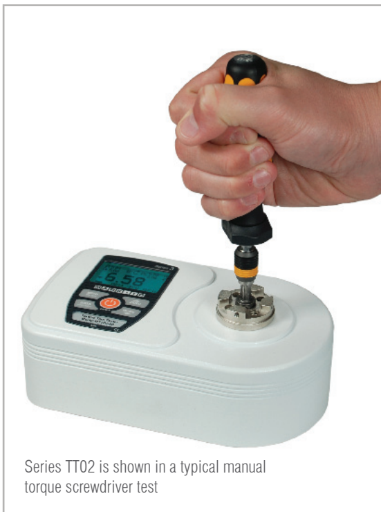
Series TT02 is shown in a typical manual torque screwdriver test

Series TT02 Torque Tool Testers present a simple and accurate solution for testing manual, electric, and pneumatic torque screwdrivers, wrenches, and other tools. These testers are compact and rugged, suitable for production environments. A universal 3/8" square receptacle accepts common bits and attachments. The TT02 captures peak torque in both measurement directions, and also calculates 1st and 2nd peaks, useful for click-type tools.