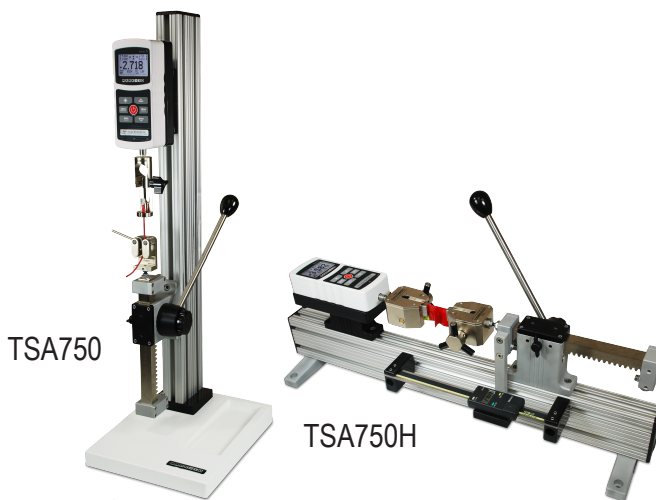
The TSA750 and TSA750H are shown testing the peel force of a sample, with a Series 5 digital force gauge, and film & paper grips